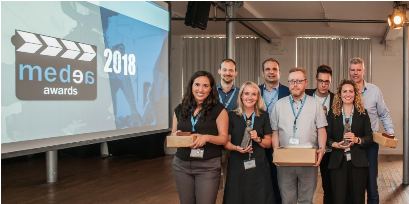
MEDEA2018 Winners and Finalists

The following finalists received runner-up prizes and commemorative medals: